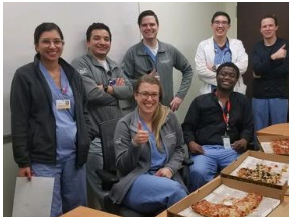
WSU/APRH residents take a much need break and enjoy a meal provided by MAFP/FMFM