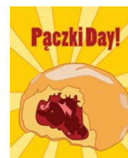
Fat Tuesday February 25 th