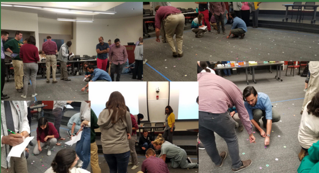
GLUE - Strategic Analysis Class. Students engage in an interactive activity designed to illustrate the challenges associated with epidemiological population sampling when gathering the data needed for planning health program interventions.