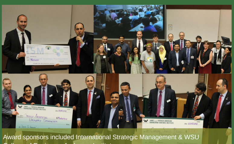
Award sponsors included International Strategic Management & WSU College of Engineers Anderson Institute