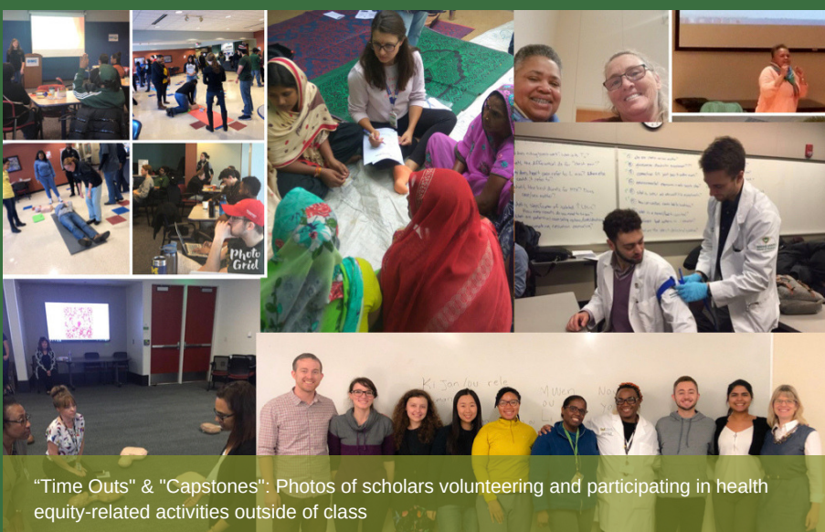
"Time Outs" & "Capstones": Photos of scholars volunteering and participating in health equity-related activities outside of class