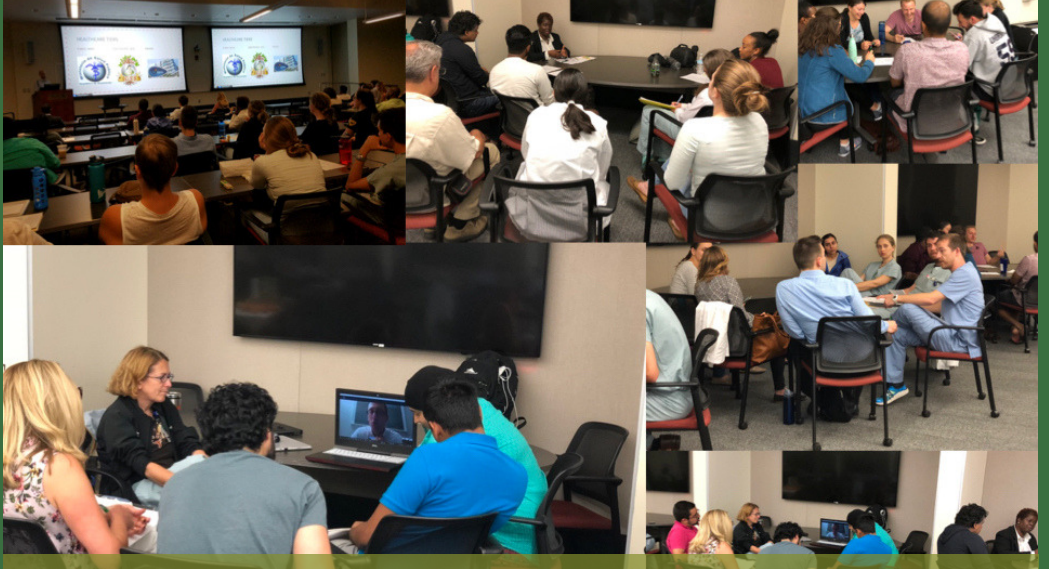
GLUE - Health Systems & the Globalization of Healthcare: Students participate in group tele-interviews with citizens from countries around the world, and Detroit, who answer questions about the intricacies of their healthcare system.