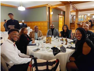
The Department of Surgery Clinical Staff