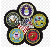
May 16 th