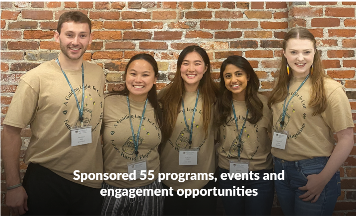
Sponsored 55 programs, events and engagement opportunities