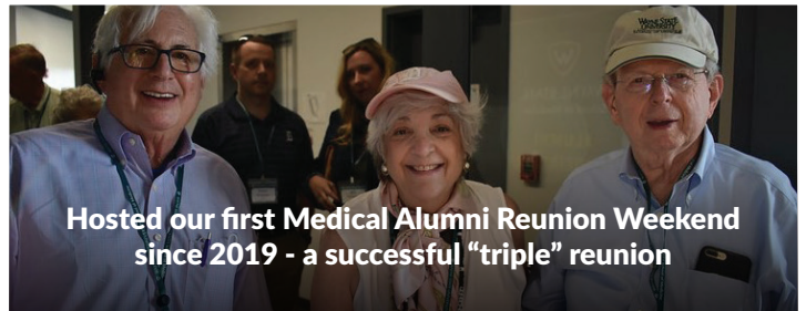
Hosted our first Medical Alumni Reunion Weekend since 2019 - a successful "triple" reunion