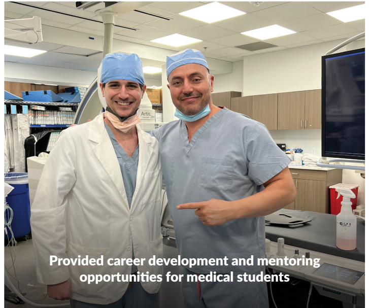
Provided career development and mentoring opportunities for medical students

Added two out-of-state members to the Medical Alumni Association Board of Governors