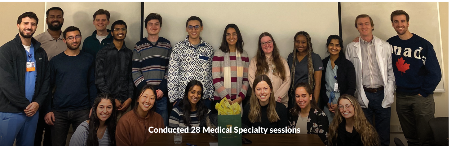
Conducted 28 Medical Specialty sessions