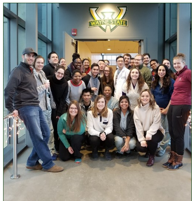
January 26, 2019