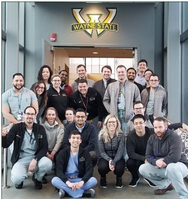
January 25, 2019

Below are photos taken of our residents before the ABSITE Exam weekend, January 25 and 26, 2019. As always, there is a calm and jovial atmosphere amongst the residents—even with the in-training exam just hours ahead of them!