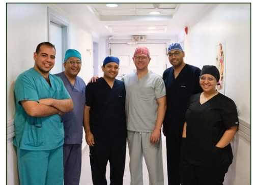
Team in Upper Egypt