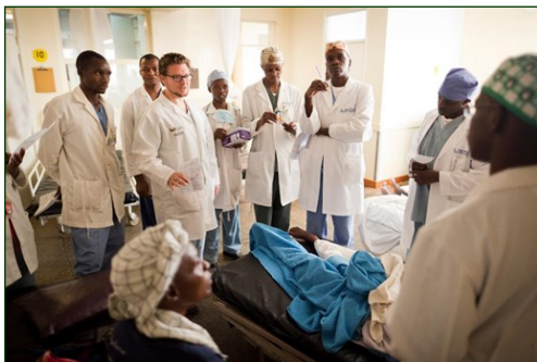
Resident Rounds in Kenya