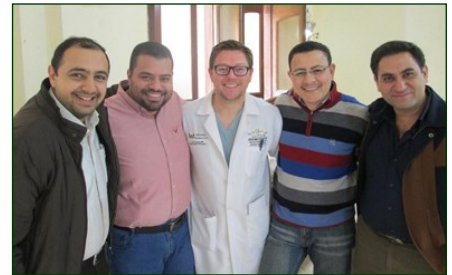
Team in Lower Egypt