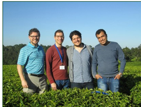
Surgical Conference in Kenya