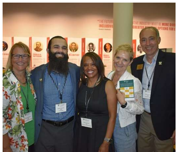
Alumni and friends came together for entertaining and informative local and regional events.