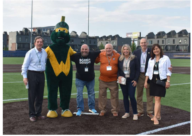
The Medical Alumni Association welcomed more than 400 alumni and guests at the Medical Alumni Reunion Weekend in May.