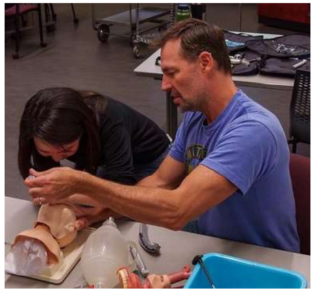
Alumni provided valuable hands-on experience and mentorship to students.