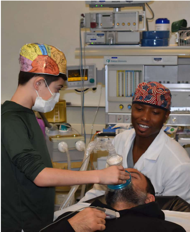
More than 300 children got a hands-on peek into the world of medicine during the annual Future Docs event.