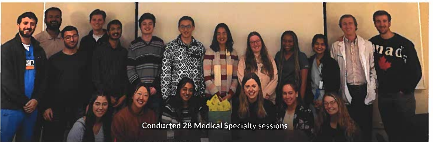
Conducted 28 Medical Specialty sessions