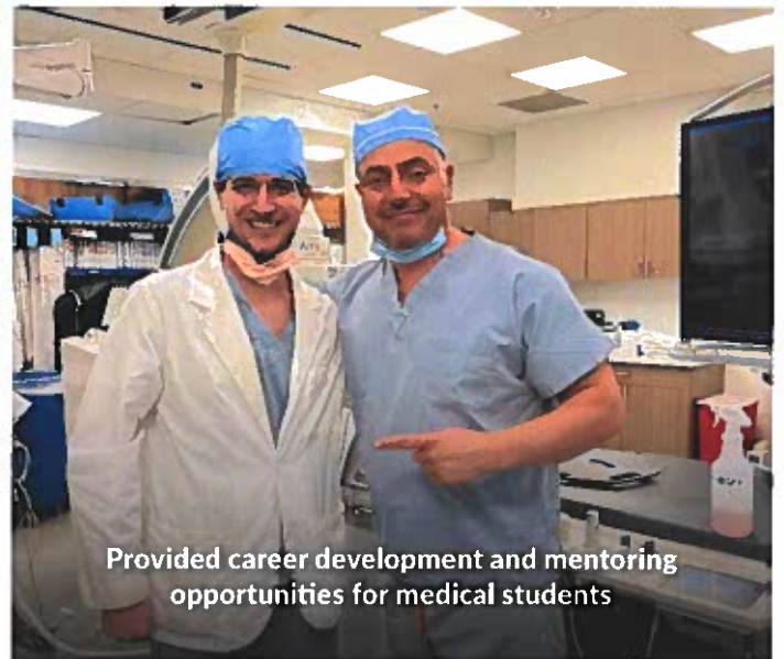
Provided career development and mentoring opportunities for medical students