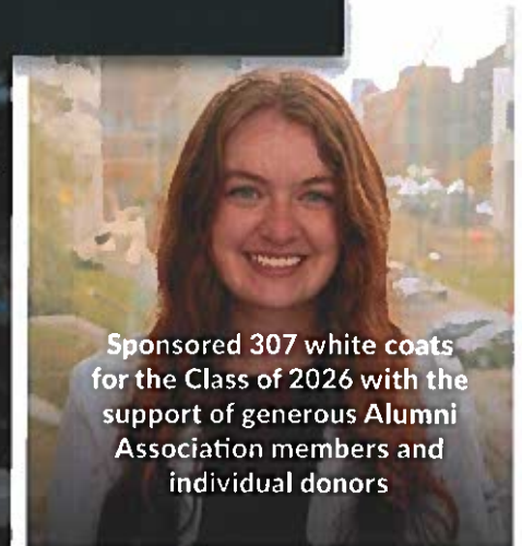
Sponsored 307 white coats for the Class of 2026 with the support of generous Alumni Association members and individual donors