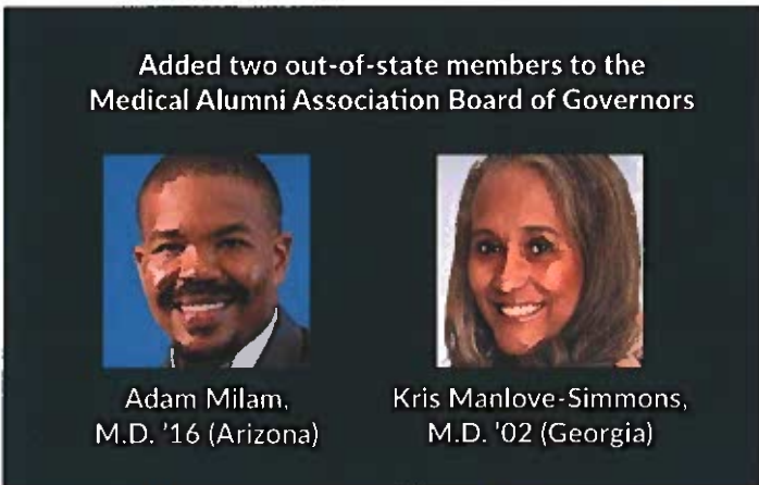
Added two out-of-state members to the Medical Alumni Association Board of Governors