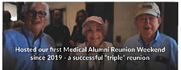
Hosted our first Medical Alumni Reunion Weekend since 2019 - a successful "triple" reunion