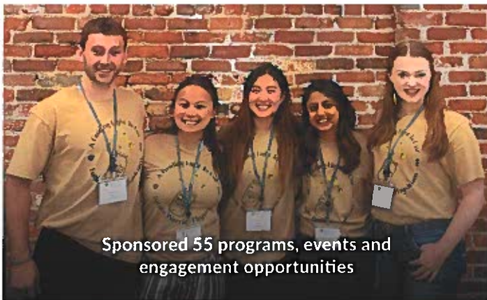
Sponsored 55 programs, events and engagement opportunities