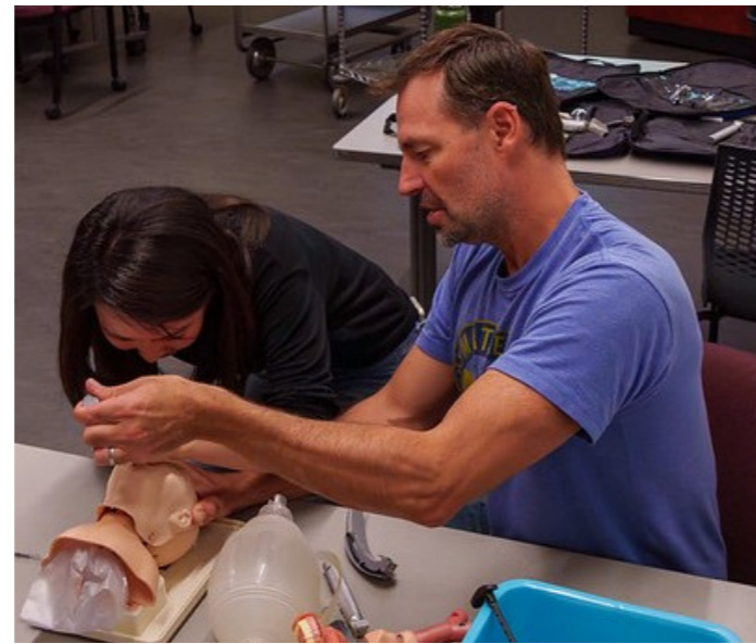
Alumni provided valuable hands-on experience and mentorship to students.