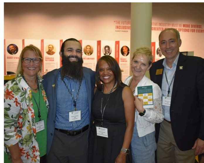
Alumni and friends came together for entertaining and informative local and regional events.