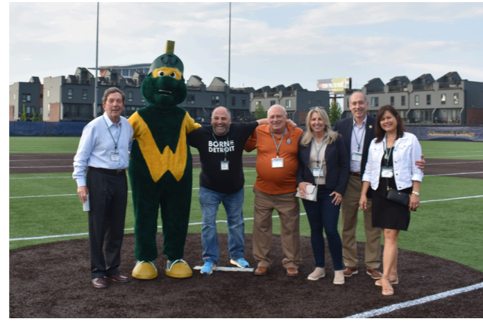
The Medical Alumni Association welcomed more than 400 alumni and guests at the Medical Alumni Reunion Weekend in May.