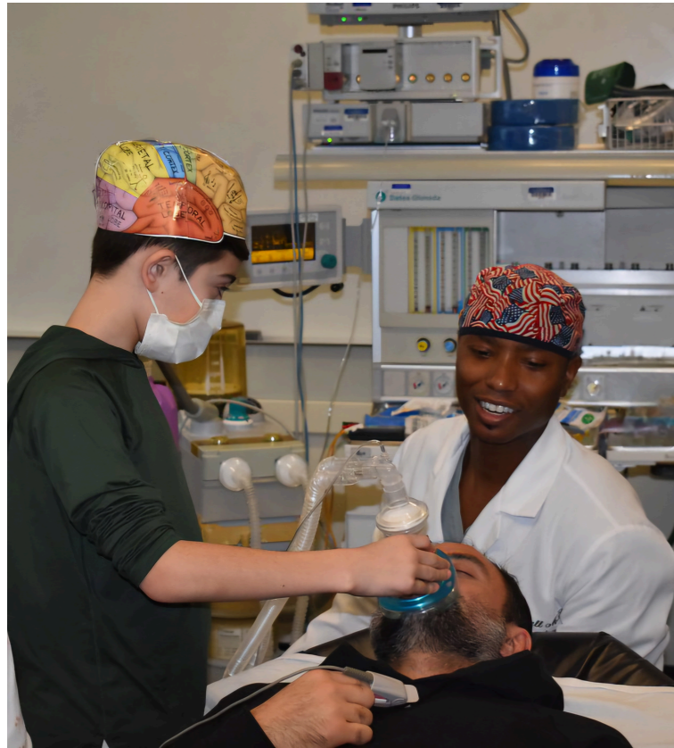
More than 300 children got a hands-on peek into the world of medicine during the annual Future Docs event.