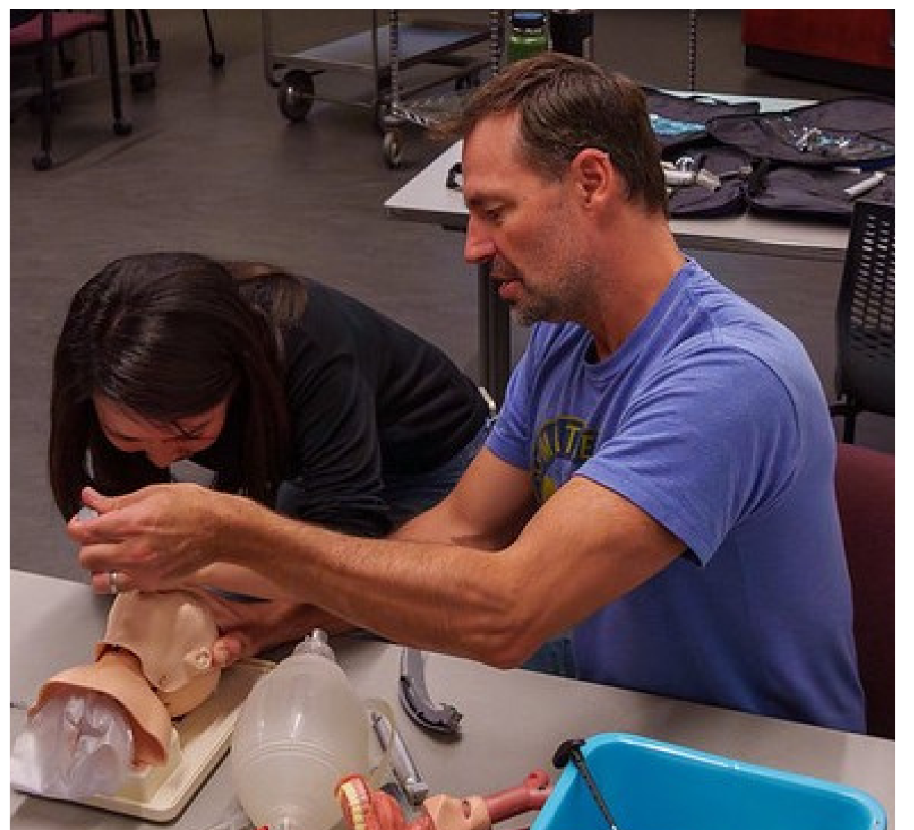
Alumni provided valuable hands-on experience and mentorship to students.