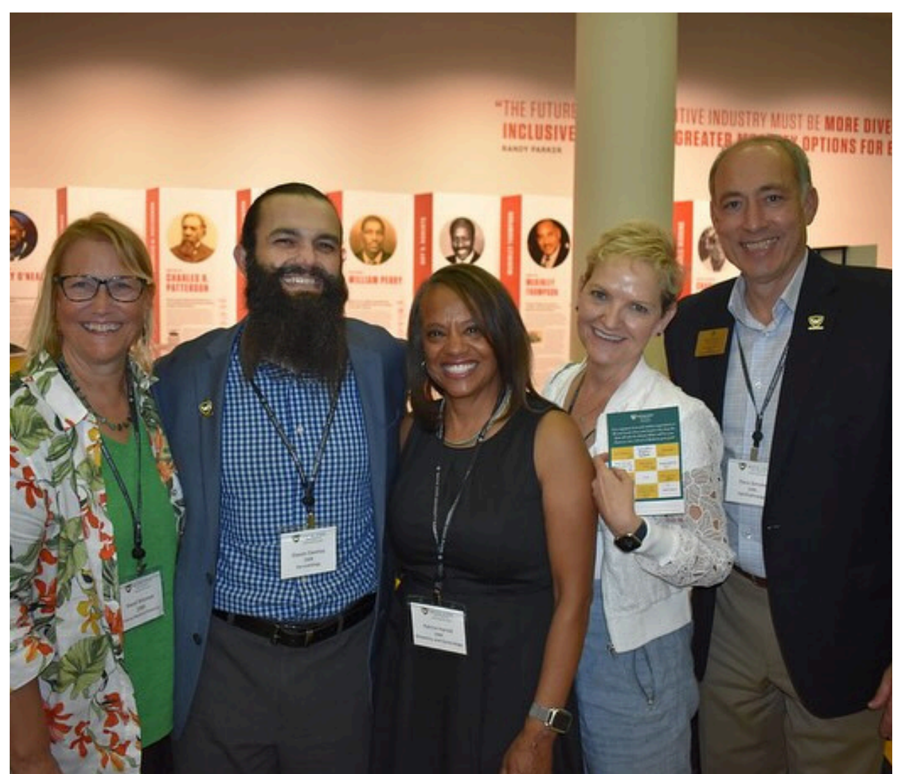
Alumni and friends came together for entertaining and informative local and regional events.