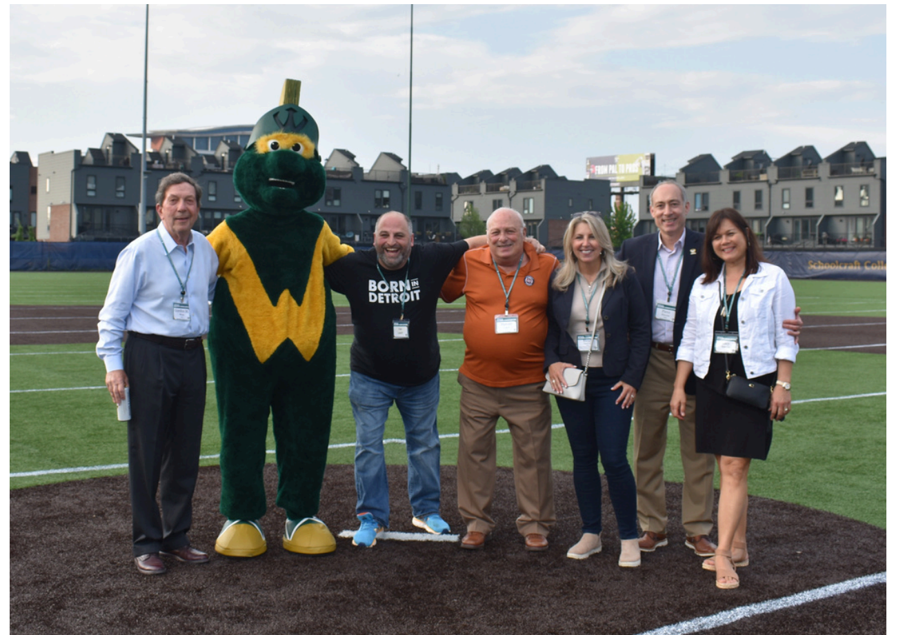
The Medical Alumni Association welcomed more than 400 alumni and guests at the Medical Alumni Reunion Weekend in May.