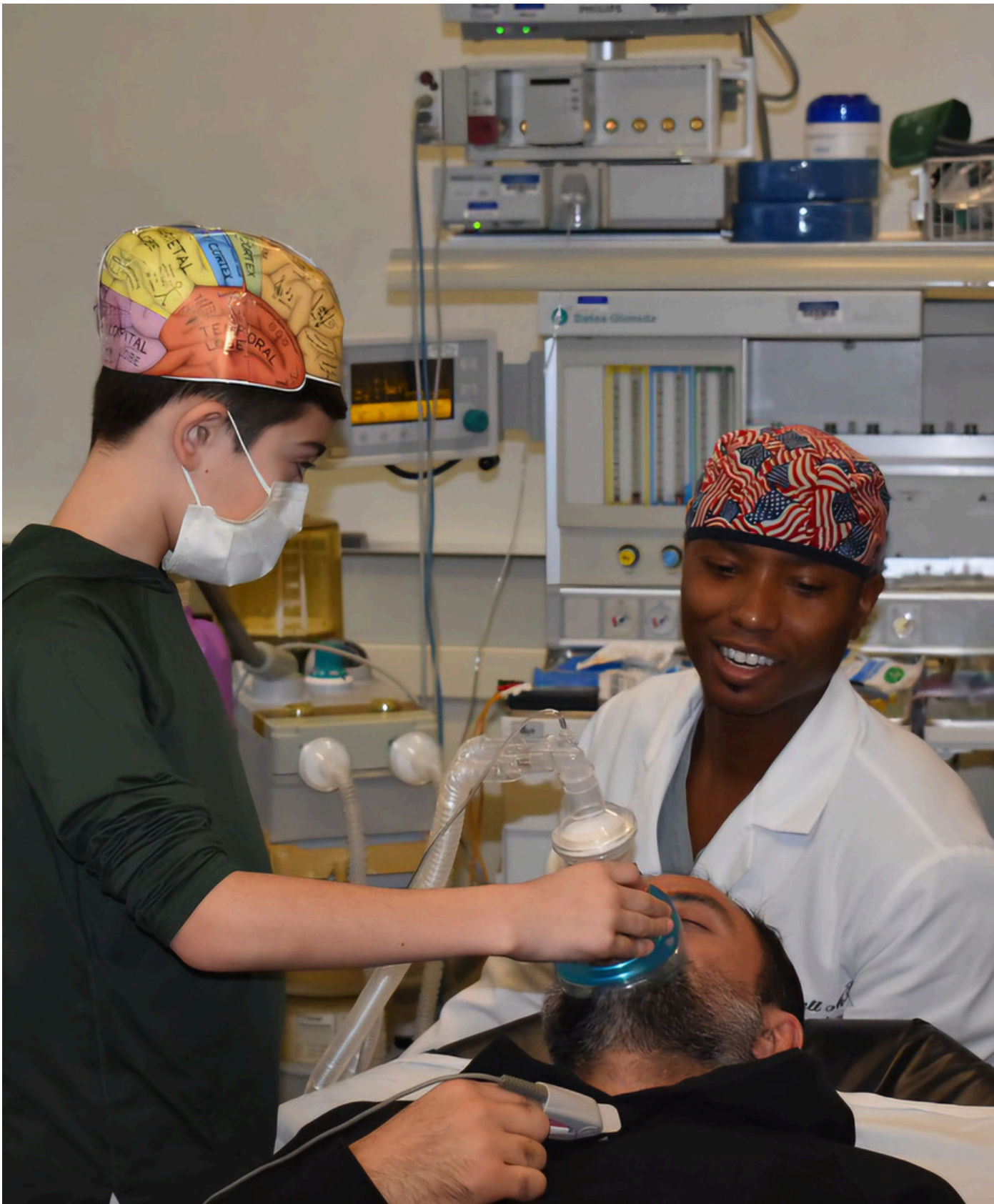
More than 300 children got a hands-on peek into the world of medicine during the annual Future Docs event.