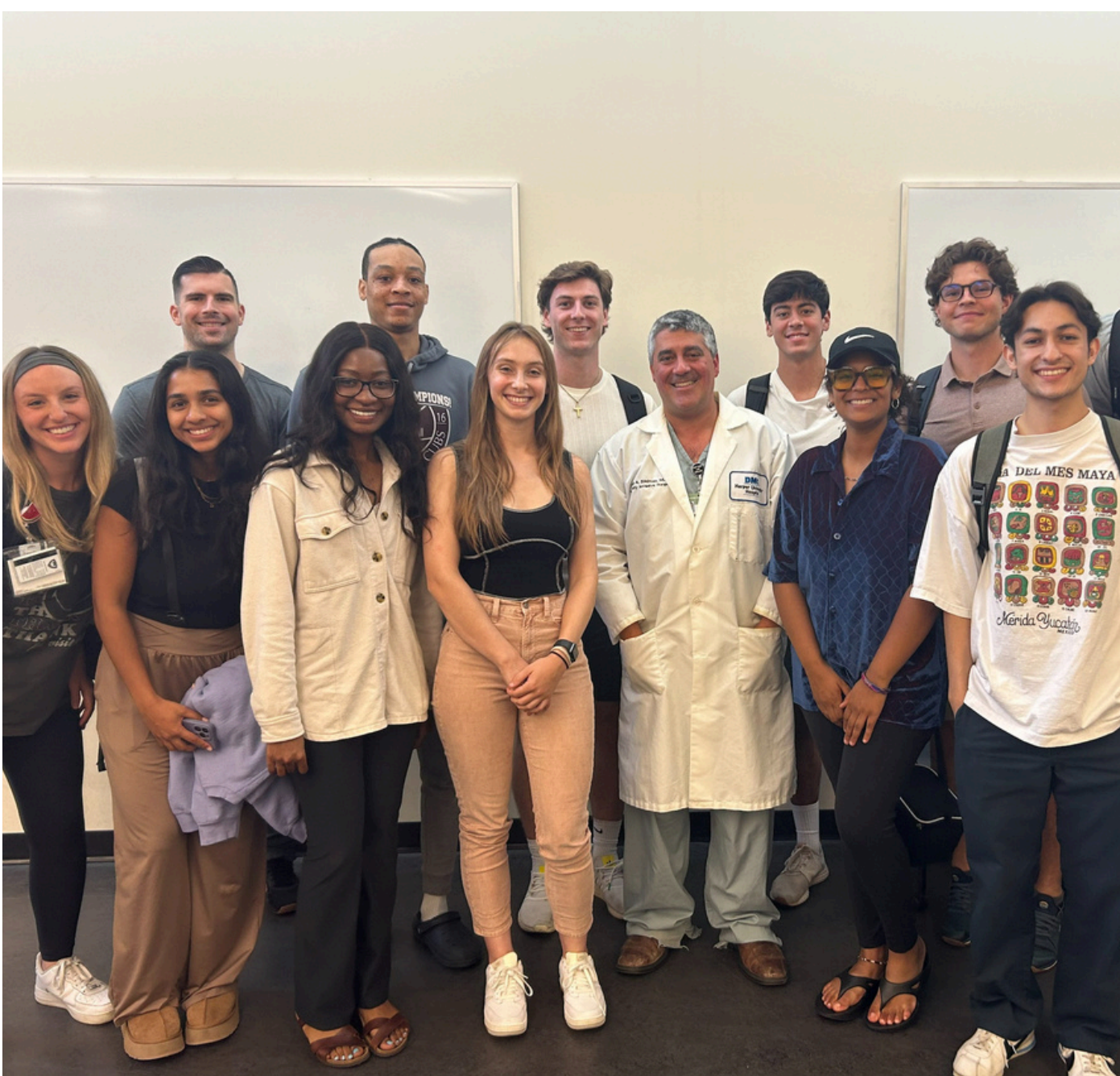
Medical students explored career paths through more than 30 Medical Specialty Sessions hosted by alumni.